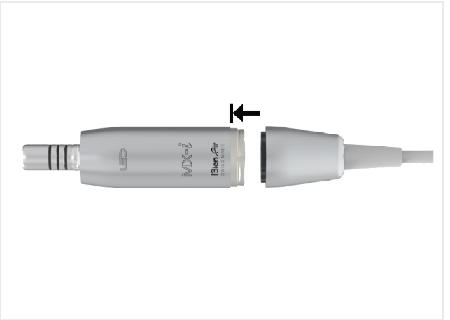
FIG. 2 FIG. 3